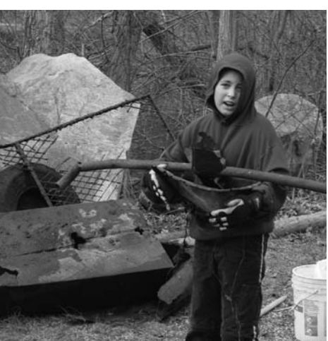
A hard working volunteer at the Lake Clean-up

LMA and the Lake Mansfield Improvement Task Force (a town appointed group) spearheaded two important safety measures at the lake's beach and parking areas in response to community concern. A split rail fence and raised crosswalk were installed in cooperation with the Great Barrington Department