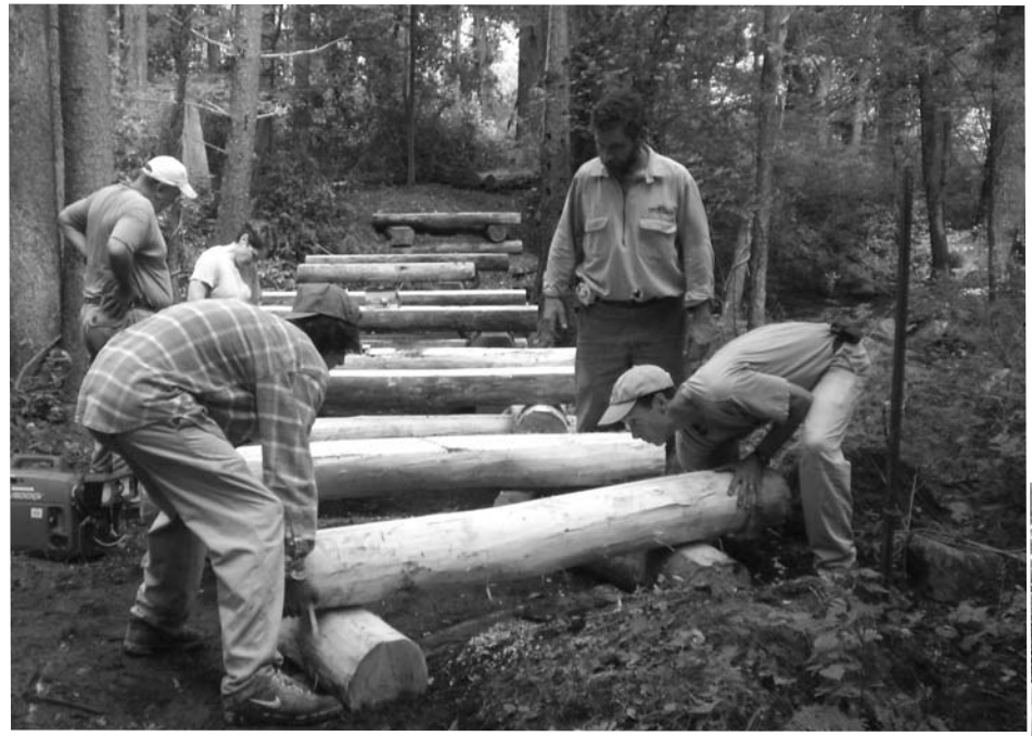
Volunteers place bridge footings

Just a few steps from the beach at Lake Mansfield a new trail has begun to take shape this summer. Located within the town-owned Lake Mansfield Conservation Forest, this trail connects the lake to the nearby Christian Hill Rd. and Welcome St. neighborhood and the Christian Hill Commons housing development. Funded by grants from the Department of Conservation and Recreation and the Berkshire Environmental Endowment, these accessible trails provide a much needed resource for people with physical challenges and a great place for many to connect with the natural world—families, our aging population, students, residents and visitors alike.