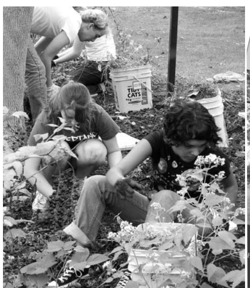
Simon's Rock volunteers weed the river bank

We look forward to another year of walking along the trail, observing new growth of our "native-native" plantings and sharing the beauty of the riverbank with the community. We are ever grateful to our donors and volunteers. Learn more at www.gbriverwalk.org