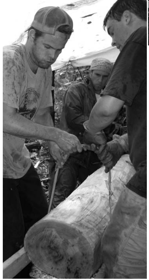
Locust logs are milled on site

The conservation forest trail project is an great example of the important work that LMA continues to do on behalf of open space, recreation, and community health. Improving the trails in the conservation forest