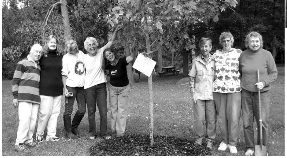
Proud tree planters around a new red maple donated by LMA and the GB Garden Club

Thank you to everyone who helped LMA accomplish so many improvements at Lake Mansfield this year. We couldn't do this without your contributions, volunteer labor, donated materials, and presence at key town meetings. Please continue to be an active lake advocate as you remind your friends and neighbors about the importance of protecting and preserving Lake Mansfield for future generations. Learn more at www.lakemansfield.org