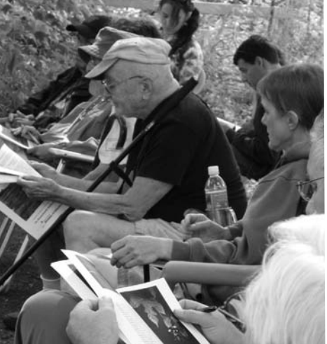
Exotic invasive plants workshop