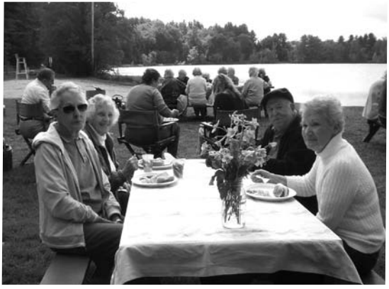
Senior Picnic Day drew a wonderful turn out

After the planting, tables were "clothed" and bedecked with flowers,