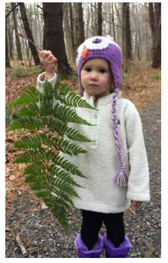
2016: Young Lake Mansfield Forest Explorer