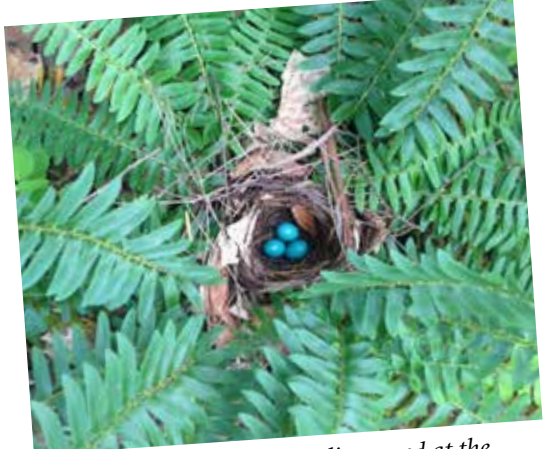
Surprise! A Veery's nest is discovered at the Pfeiffer.

and migratory birds and is visited by fox, beaver, bobcat, white-tailed deer, coyote and other mammal species.