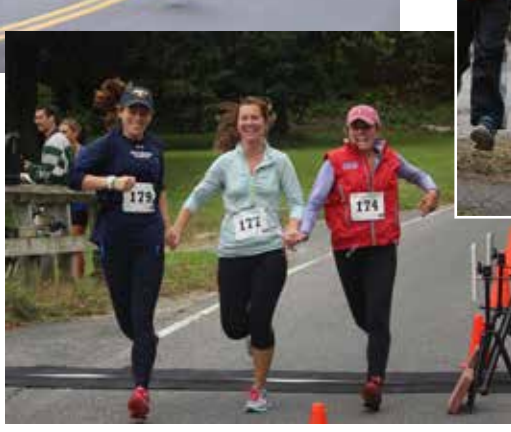
1k 10k 211