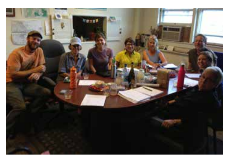
GBLC board members plan for future conservation

We enthusiastically welcome them to our Board of Directors.