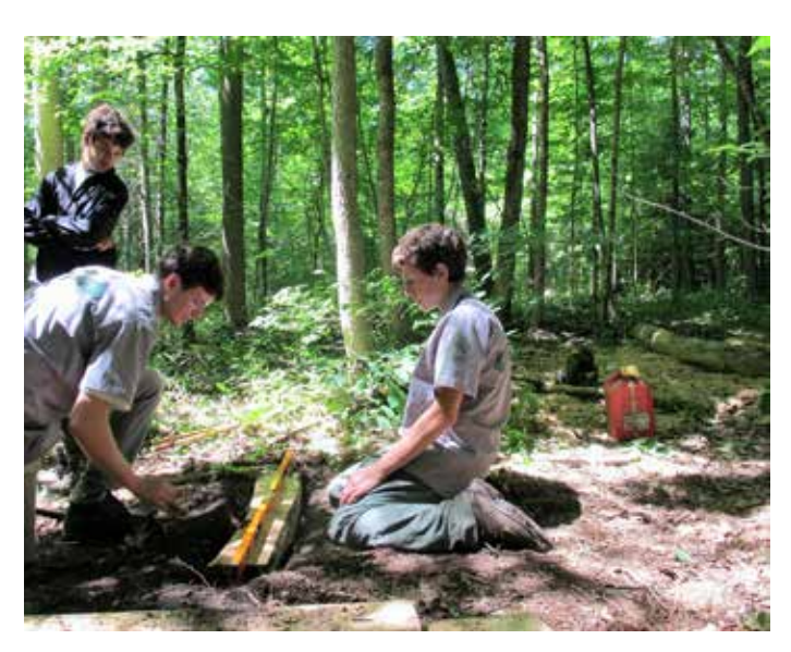
2012: Greenager Trail Crew members carefully installed bog bridging. The 2017 Trail work will again employ local youth to repair local trails.

You can be a part of this great work! Become a Friend of the Pfeiffer Arboretum and volunteer or provide a dedicated donation to help fund this ambitious project. If all goes according to plan, we will invite GBLC members and the community to a trail celebration in September 2017.