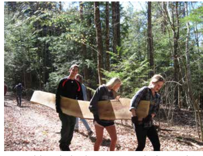
2012: Berkshire School students transport new lumber to worksites. Volunteers will be important again in 2017.

frontage on the water, which, unlike most Berkshire ponds and lakes, has remained undeveloped over the years due to its designation as the water supply for the village of Housatonic. With Tom Ball Mountain as a backdrop, the pond's 113 acres and nearly 1500 feet of shoreline offer a remarkably serene setting. The woodland is home to a diverse and impressive population of tree species including black ash, tulip poplar, butternut, hemlock, shagbark hickory, and large sugar maples along with abundant understory shrubs and wildflowers. This rich habitat sustains many nesting