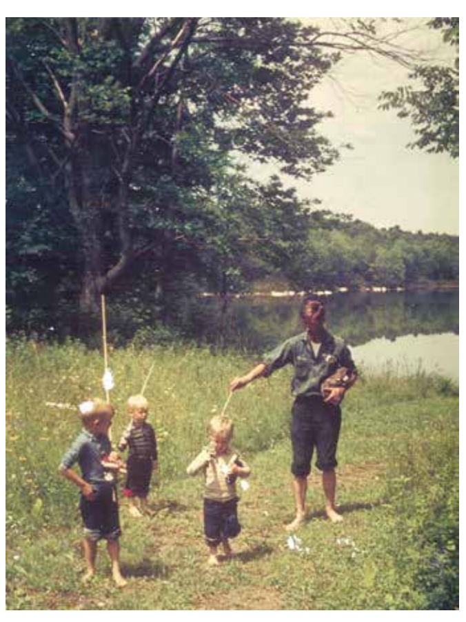
1963: Family Fishing Day at Lake Mansfield

Though improvements are expected to take several years to implement, fueled by a deep commitment to the overwhelming value of a healthy lake to all, we can move forward with a greater certainty that a vibrant Lake Mansfield will be there to support and inspire the children of tomorrow.