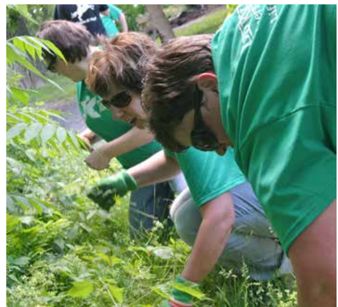
Help Greenagers care for the trail! Join us for our Earth Day workday, Sat. April 22, 2017 or book a special workday for your group.