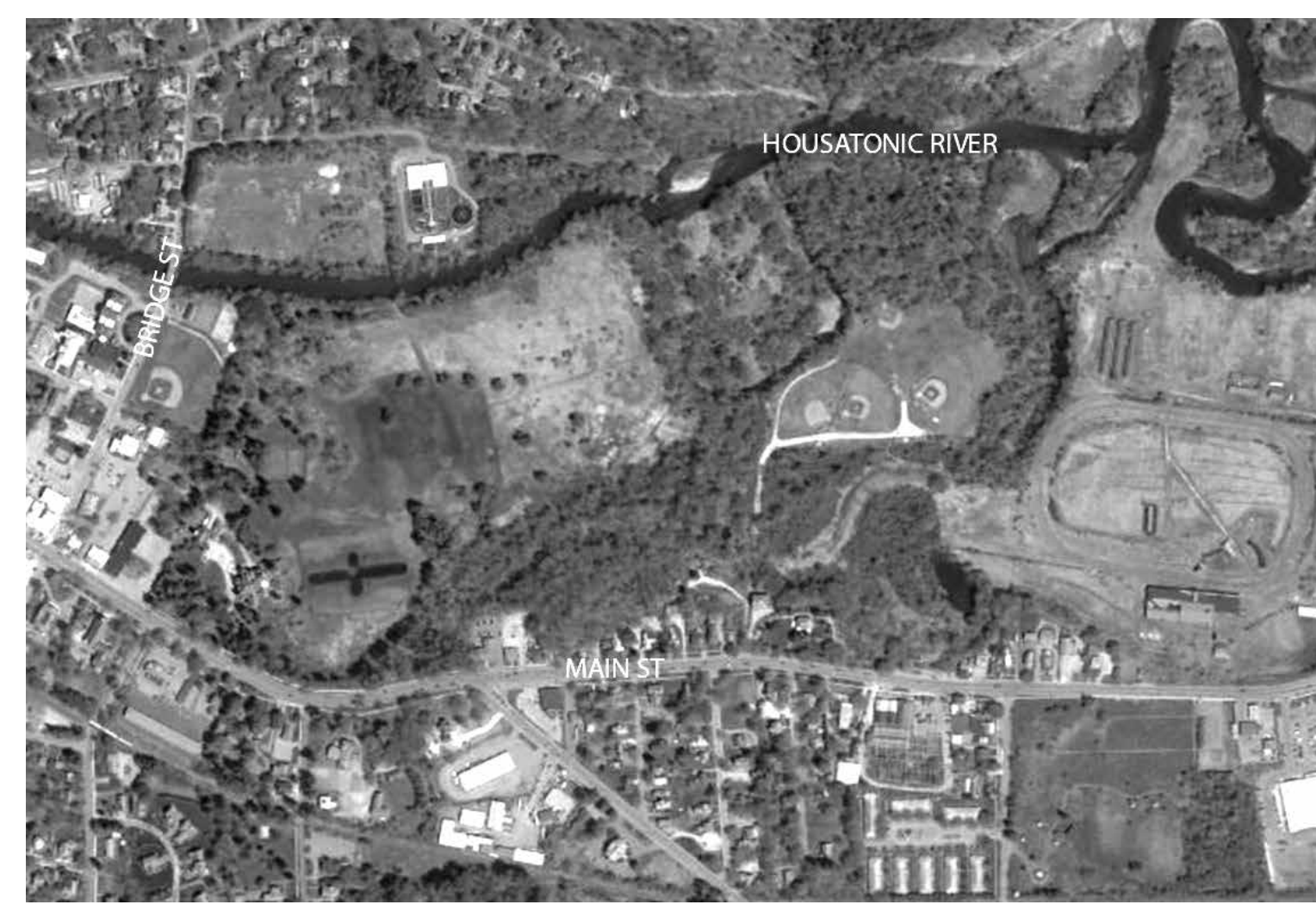
A southward riverside trail is envisioned between Bridge Street and Brookside Road to connect walkers with the beauty and nature of the Housatonic River and to enhance community health and walkability.

The Great Barrington Land Conservancy (GBLC) is excited to champion a collaborative vision for a community trail that extends along the riverfront from Bridge Street to Brookside Road.