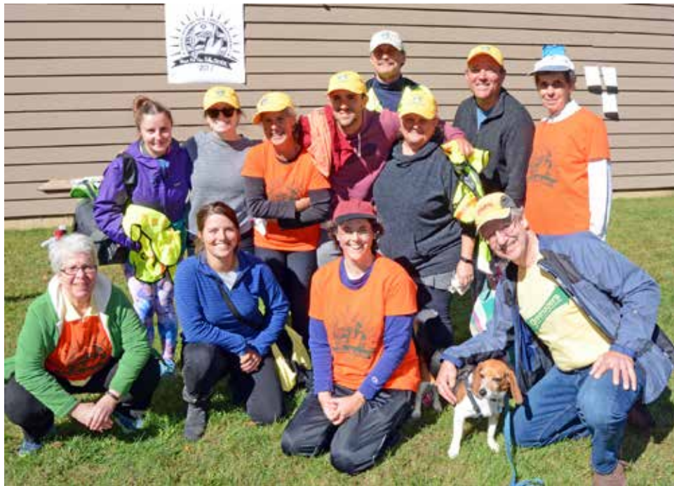
Run for the Hills Volunteers. Volunteers are invaluable to GBLC's efforts.

If you have a special talent, skill, or interest that you don't see listed above, there is most likely still a way for you to contribute to GBLC. One of our board members would love to get a cup of coffee or take a walk in the woods with you to talk about how you can get involved. We can't wait to meet you!