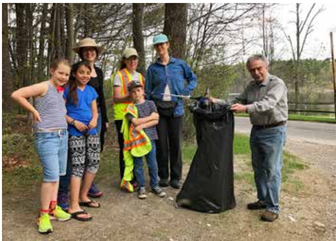
Lake Mansfield Clean Up Volunteers

grant of $106,400 is being used to complete detailed engineering of Lake Mansfield Road from the boat launch north and for an improvement design for the outlet structure. A $288,925 Department of Environmental Protection grant has been awarded to Great Barrington to install stormwater structures needed to capture sediment on Knob Hill. In addition, State funding is currently being sought for improvements to the boat launch area. Town support of a healthy habitat and safe recreation area is essential to this success.