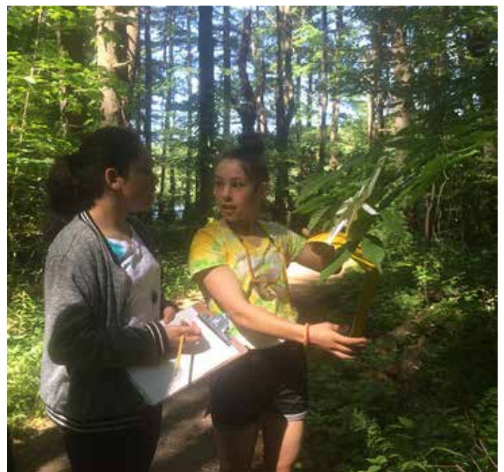
Local students learn about forest ecology at Lake Mansfield

Your support will also allow GBLC to help fund forest trail improvements and beach area amenities in 2018. The next phase of trail improvements will be led by the town to complete the accessible crushed stone surface of the