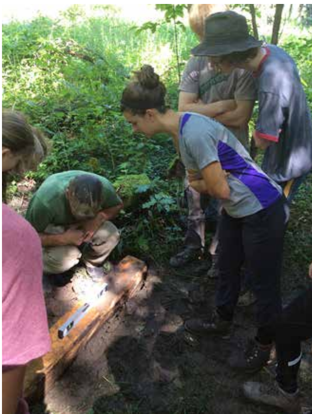
Local teens learned valuable skills as trails were improved at Pfeiffer Arboretum.

As they updated our Board members at Committee and Board meetings throughout the year, I have learned that successful grant writing is only the beginning. This year Pfeiffer Arboretum, River Walk and the newly envisioned Riverfront Trail, to run south from Bridge Street to Brookside Road, were recipients of