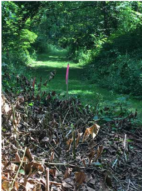
View along the proposed Riverfront Trail route