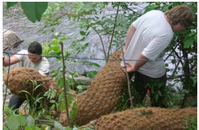
Stabilization of the River Bank