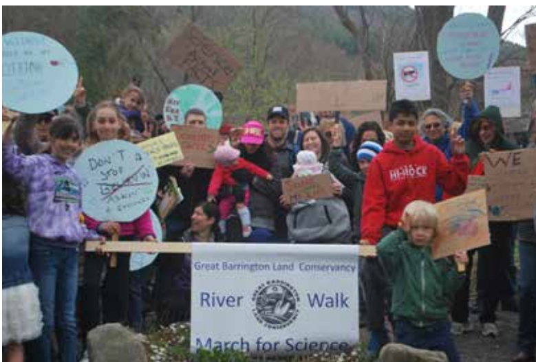
River Walk Science March