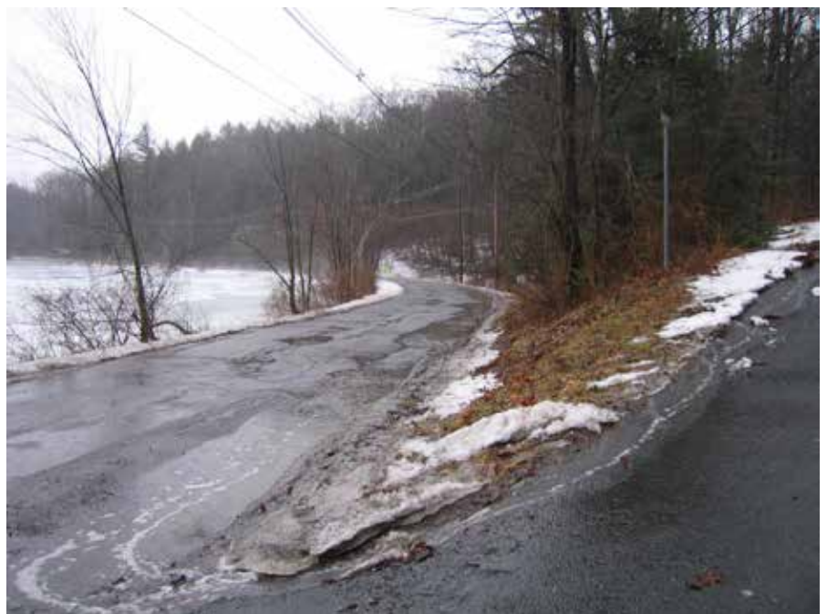
Rainwater and snowmelt from Knob Hill Road

Thanks to the efforts of the Lake Mansfield Improvement Task Force (LMITF) and our partners including the Lake Mansfield Alliance, a project of Great Barrington Land Conservancy, the Town of Great Barrington has received another grant from the Massachusetts Department of Environmental Protection to mitigate pollution that