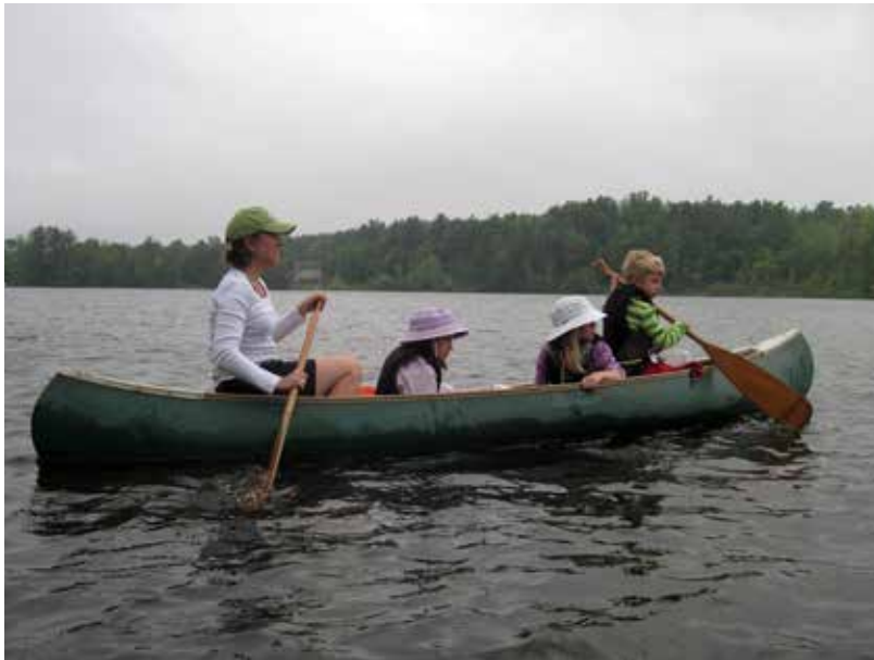
Families count on clean water at Lake Mansfield

like driveways, sidewalks, and streets prevent stormwater from naturally soaking into the ground. Stormwater can pick up debris, chemicals, dirt, and other pollutants and flow into a storm sewer system or directly to a lake, stream, river, wetland, or coastal water. Anything that enters a storm sewer system is discharged untreated into the waterbodies we use for swimming, fishing, and providing drinking water.