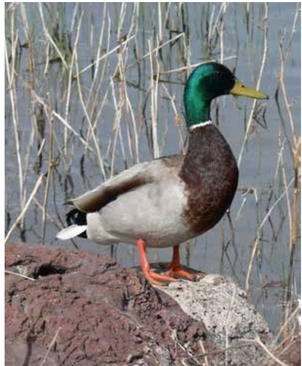
Clean water means a great lake for all!

We partner with Housatonic Valley Association to affix these labels to LM area drains