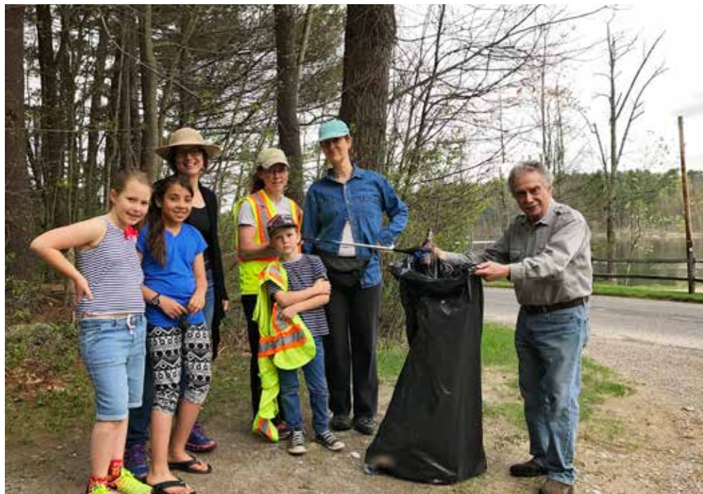
2017 Lake Day Volunteers. Can you lend a hand this year?

questions. This year Lake Mansfield Improvement Task force members will be on hand to provide information on the next steps to accomplish our improvement plan. Throughout the day, a self-guided forest tour will be available to kids and adults. You can help to improve the lake habitat helping to plant a Lake Mansfield demonstration pollinator garden in support of Great Barrington's town plan to be a pollinator friendly community.