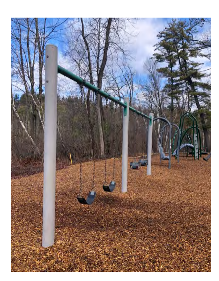
Come play! The new playground donated by the Shoval family is open and ready for all to enjoy.

Get involved! Lake Mansfield Improvement Task Force meetings are open to all. Visit <u>townofgb.org/lake-mansfield-improvement-task-force</u> for more information about upcoming meetings.