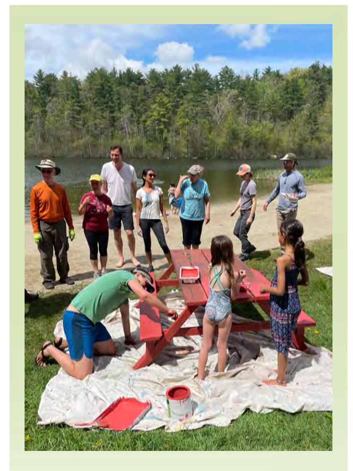
2022 volunteers in action. For the complete photo gallery visit <u>GBLand.org</u>.

Lake Mansfield volunteers have been steadfast, joyful, and committed for the long haul. They have given thousands of hours of service to provide the community with the spaces we all enjoy. Over the years volunteers have planted trees, installed split-rail fences and kiosks, built and cared for forest trails, and served on the many committees that are involved in overseeing the lake and forest.