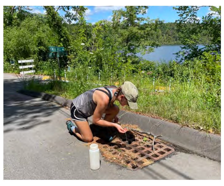
Simon's Rock interns collect water samples for study.

The basics of the improvement plan remain as stated in last year's newsletter. The lake outlet pipe will be supplemented and the road raised to eliminate flooding. The beach area will feature gently sloping paths for handicapped accessibility. The main parking lot will be enlarged and designed to capture and treat stormwater runoff. Finally, the section of road from the boat launch to the beach area will be closed to vehicular traffic and transformed into a recreation path while the bank will be stabilized and planted with native vegetation.