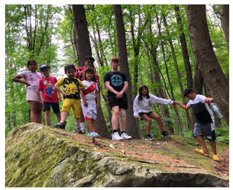
2022 Kids in Multicultural Bridge's Happiness Toolbox Summer Program exploring Lake Mansfield Forest.

This summer, Berkshire Balance Center will provide a guided experience through the Lake Mansfield trails for Multicultural BRIDGE community members. The event will begin with an immersive nature walk led by a certified Kripalu Mindful Outdoor Guide. Participants will also take part in a yoga based movement practice appropriate for all levels and ages. Finally, attendees will learn and practice skills to help with nervous system regulation and stress management. The backdrop of Lake Mansfield and the surrounding forest will provide a serene and inspiring setting. Date and time to be determined... please keep watch for scheduling announcements!