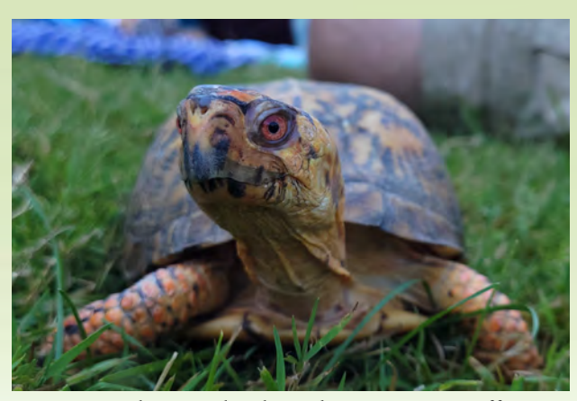
Larry the Turtle

Date and time to be determined. For more information email <a href="mailto:info@gbland.org">info@gbland.org</a>.